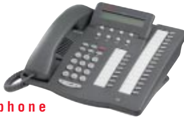
Avaya 6424D+M Display Telephone

The Avaya 6424D+M Display Telephone expands Avaya 6416 Telephone functionality, adding eight flexible feature keys and includes plug-and-play functionality upgrades.