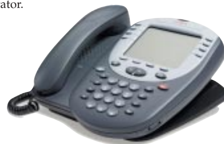
Avaya 2420 Digital Telephone

The phone can be configured for use in the call center environment, providing flexibility for the system administrator.