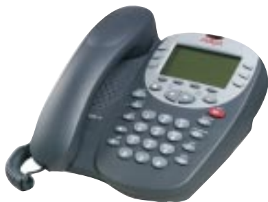
Avaya 4610SW IP Telephone