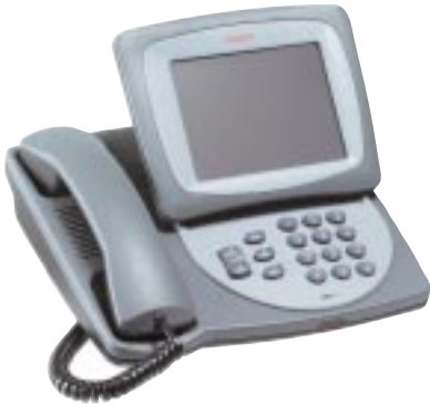
Avaya 4630SW IP Screenphone